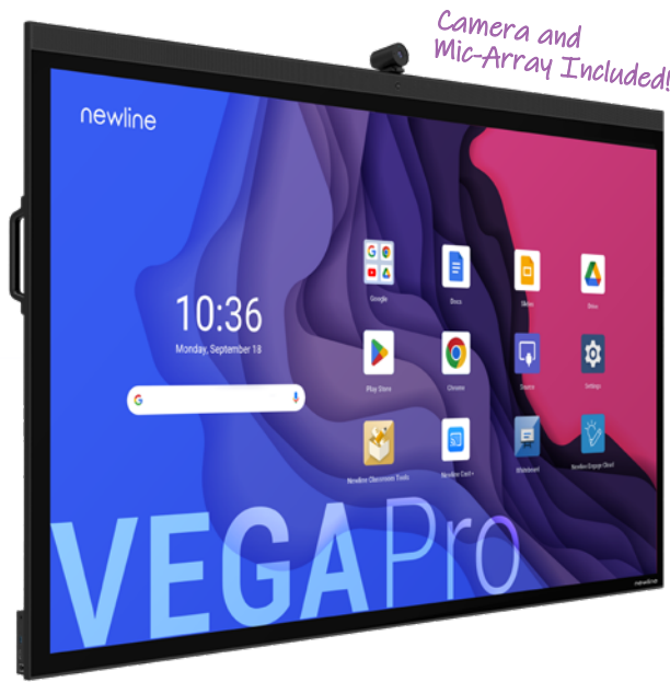
Camera and Mic-Array Included!

Vega is the brightest star in the northern constellation of Lyra and relatively close at only 25 light-years from the Sun.